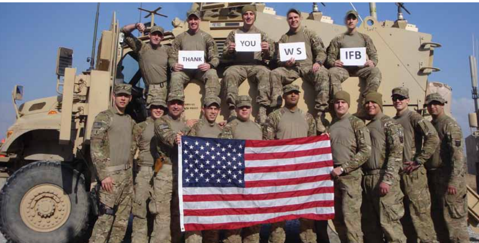
Airmen at Bagram Air Base in Afghanistan thank Winston-Salem Industries for the Blind employees for producing the OCP (Operation Enduring Freedom Camouflage Pattern) combat shirt for U.S. warfighters.