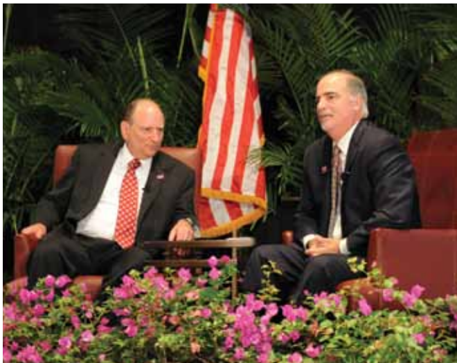
U.S. AbilityOne Commission Vice Chairperson Jim Kesteloot and Chairperson Tony Poleo.

The AbilityOne® Program is the largest source of employment for people who are blind or severely disabled in the United States. The program is administered by the U.S. AbilityOne Commission, the new operating name as of October 1, 2011 for the Committee for Purchase From People Who Are Blind or Severely Disabled.