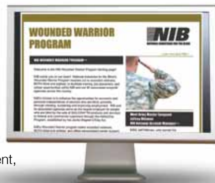
New Wounded Warrior Program landing page at www.nib.org/woundedwarrior

NIB is reaching out to veterans and Wounded Warriors of the Afghanistan and Iraq conflicts through job fairs and conferences, the Department of Veterans Affairs, and service and veterans organizations such as the American Legion, Veterans of Foreign Wars, Disabled American Veterans and the Blinded Veterans Association. NIB and its associated nonprofit agencies offer training, job placement, career opportunities, and guidance with transition to civilian life for veterans who are wounded with any type of injury, including those who are blind.