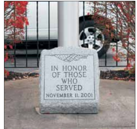
Veterans Memorial at Central Association for the Blind and Visually Impaired in Utica, New York.

Members of the Veterans Roundtable in Tyler, Texas, a support network for veterans focused on education, housing, and medical care, toured Horizon Industries, a division of East Texas Lighthouse for the Blind,