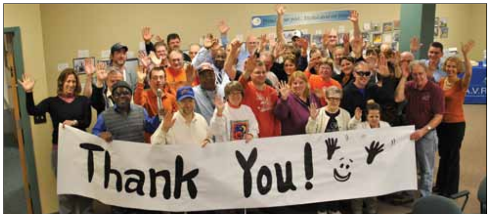
The A.V.R.E. staff thanks donor agencies for flood relief contributions.

Following the flood in September caused by Tropical Storm Irene, the Association for Vision Rehabilitation and Employment (A.V.R.E.) in Binghamton, New York, coordinated donations of relief supplies from other NIB associated agencies. A.V.R.E. received items such as cleaning supplies, protective gloves and masks, plastic bags, and food service paper products, and distributed them to recovery and relief centers in the Binghamton area.