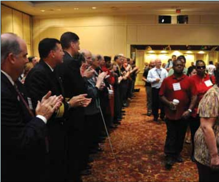
Conference attendees welcome employees of the year into the meeting hall.