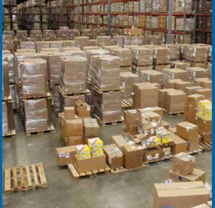
Interior view of one of three warehouses operated by the Travis Association for the Blind, Austin, Texas.

Vocollect is used by many businesses because it enables organizations to reduce training time, increase accuracy and enhance productivity and safety. Manhattan SCALE tracks inventory as it moves through the warehouses,